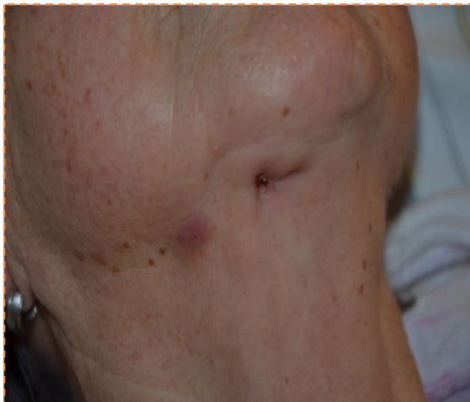
Figure 5.: Chronic infection and fistula on the right submental/submandibular side

This case was referred from the dermatologists and was a 38-year-old male complaining of a purulent discharge from a non-healing wound on the right cheek (Fig. 4). The patient thought the lesion was due to his shaving technique, but noted no improvement after changing to an electric razor from a hand held razor.