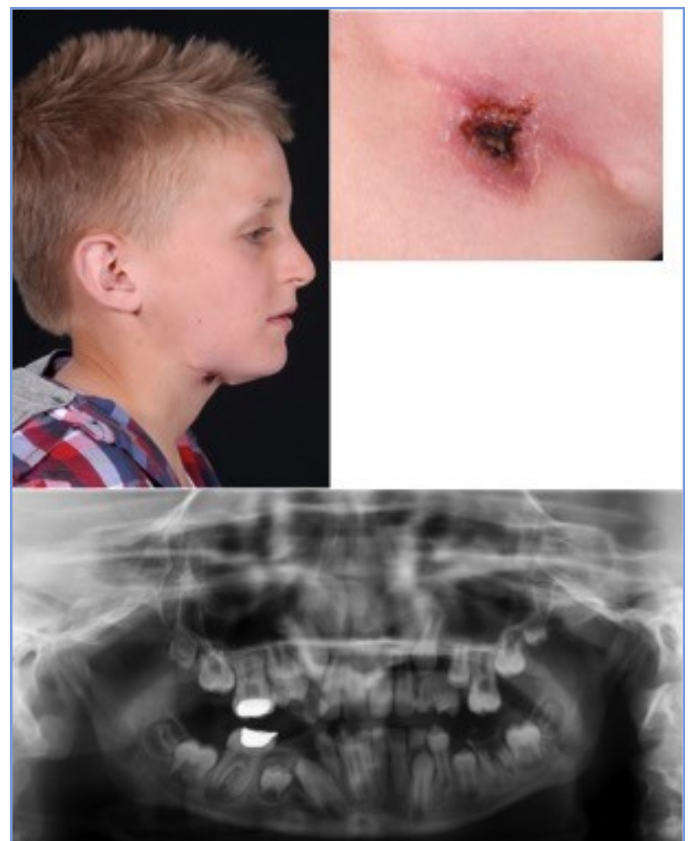
Figure 3a-c: Skin lesion right submental area, OPG mixed dentition with moderately restored LR6 and UR6, a big cavity around the LL6 and periapical radiolucency around LR6

This was a referral made to the ENT department by a GP of a 12-year-old school boy who had a non healing wound in the right submandibular area. His GP and another ENT-Department had previously treated him for several months with topical antibiotic ointment and a surgical excision was also performed, however, the non healing area recurred shortly after the procedure. On clinical examination, the lesion was 1cm in diameter and was located in the submandibular region on the right side. A 2.5 cm scar after attempted excision of the skin lesion was noted. A thorough history revealed, from the patient and his parents, multiple dental problems and treatments in the past (Fig. 3 a-b). The patient was then referred to our department.