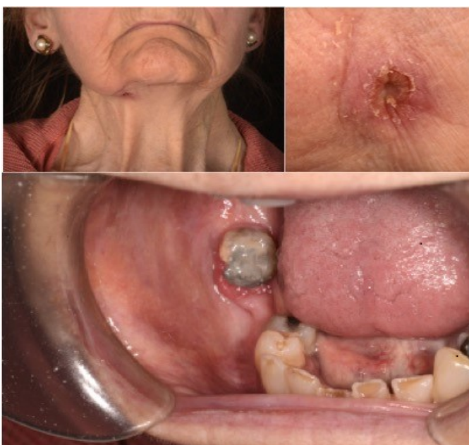
Figure 2a-c: Skin lesion right submental region and intra-oral examination finding

This case was an 87-year-old Caucasian lady was also referred to the ENT department for a right sided submandibulectomy by her local Otolaryngologist. On examination, there was a 1cm raised erythematous plaque, which was tethered to the underlying mandible. Intraoral examination revealed a problematic right molar tooth (Fig 2a-c). On suspicion of an infected dental sinus as the cause of her symptoms, an OPG was performed and the patient was referred to the craniofacial unit afterwards. We performed an extraction of the lower right 5 and biopsied the skin lesion. The microbiology results were similar to those