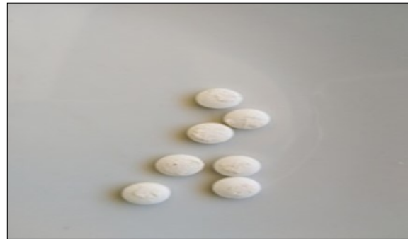
Figure 3. Delayed coated tablets (F1)