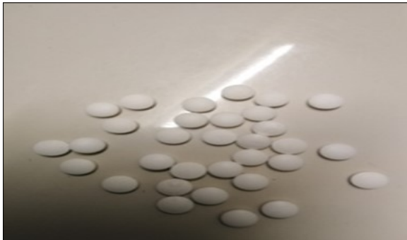
Figure 2. uncoated placebo tablets