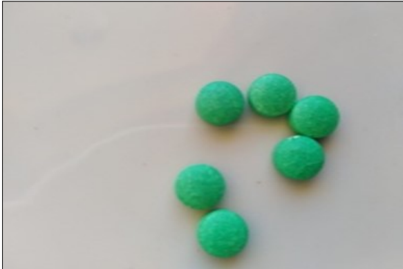
Figure 6. Delayed coated tablets (F4)