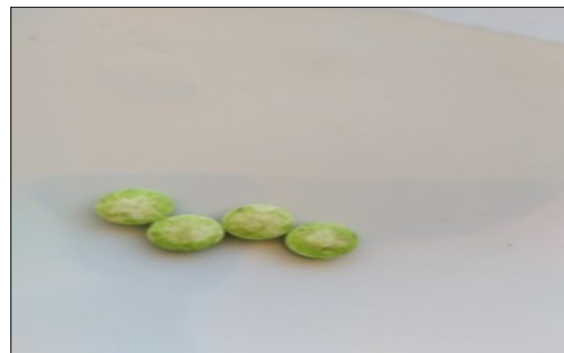
Figure 5. Delayed coated tablets (F3)