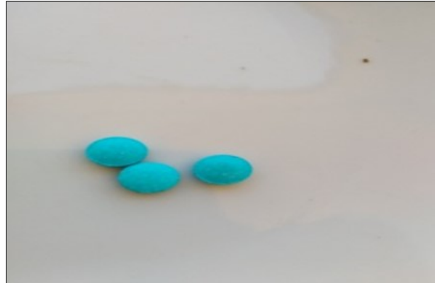
Figure 7. Delayed coated tablets (F5)