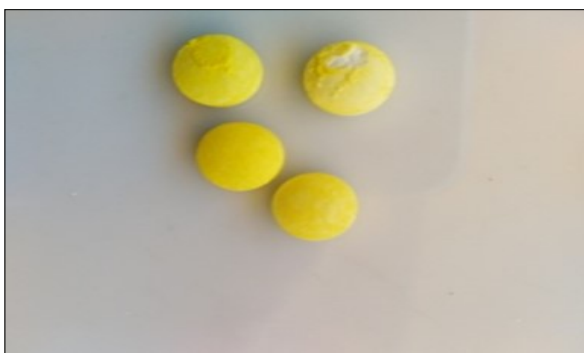
Figure 4. Delayed coated tablets (F2)