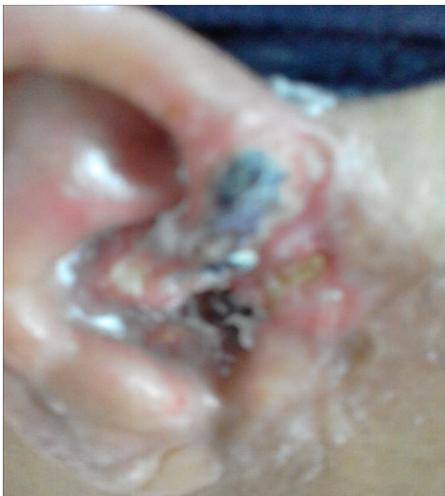
Figure 4. Right ear; Basal Cell Carcinoma (BCC) seen in the skin of ear and adjacent areas, sloughing of cancer cells seen after Bee Venom subcutaneous injection.