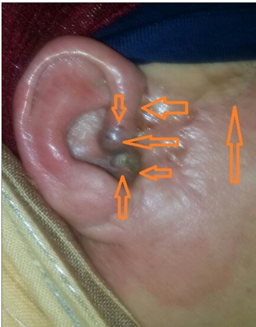
Figure 3. Right ear; Basal Cell Carcinoma (BCC) seen in the skin of ear and adjacent areas, slight edema seen after Bee Venom subcutaneous injection.