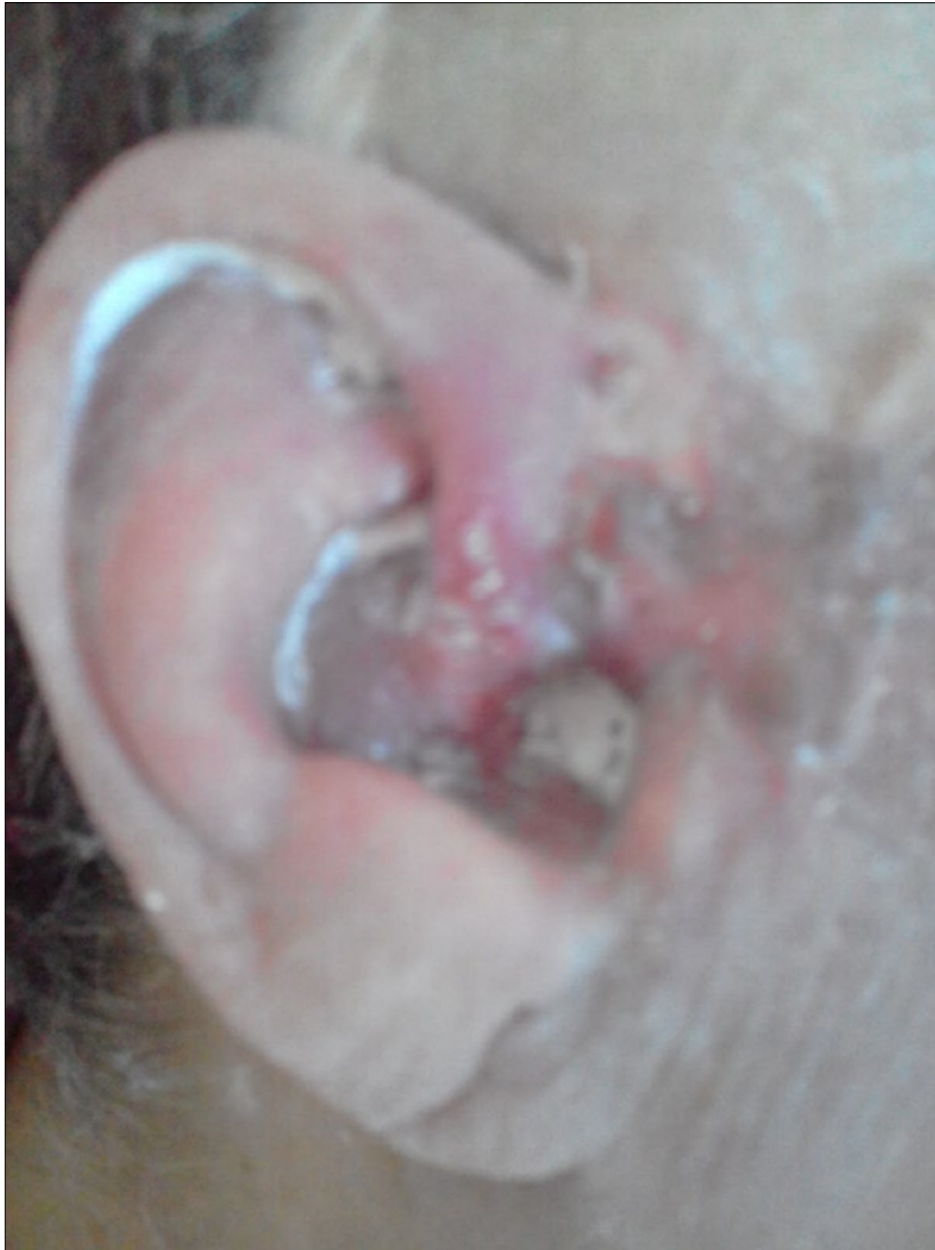
Figure 5. Right ear; Basal Cell Carcinoma (BCC) seen in the skin of ear and adjacent areas, removal of cancer cells after Bee Venom subcutaneous injection.