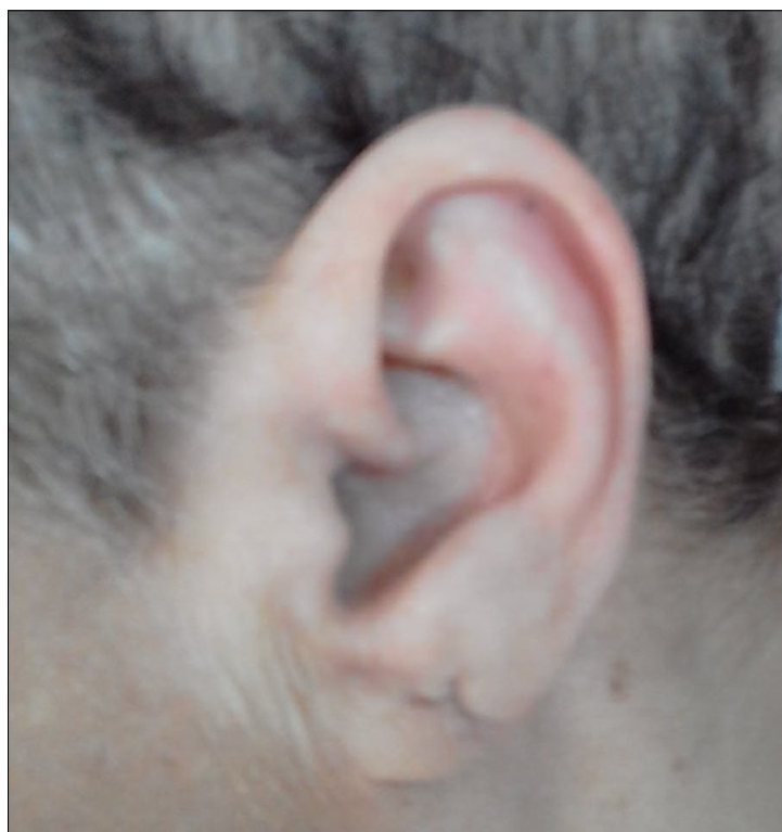
Figure 2. normal left ear