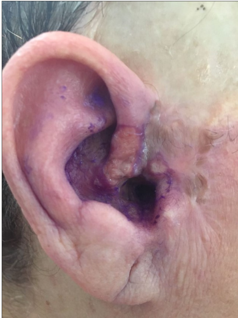
Figure 6. Right ear; Basal Cell Carcinoma (BCC) seen in the skin of ear and adjacent areas, removal of cancer cells after Bee Venom subcutaneous injection.