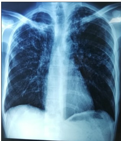
Figure 1. Pneumoperitoneum on chest X Ray

The histopathologic examination of the resected bowel specimen showed caseating granulomatous inflammation (Fig-2), consistent with intestinal small